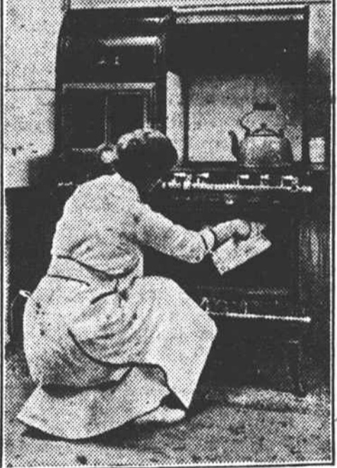
Baking Rice Pudding.

Wash one tablespoonful of uncooked rice and add one quart milk, one-third cupful of sugar, one-eighth teaspoonful nutmeg or cinnamon and one teaspoonful of salt. Pour the mixture into a good-sized baking dish, and cook in the oven slowly for about two or three hours, stirring it frequently. If allowed to cook slowly, the milk thickens