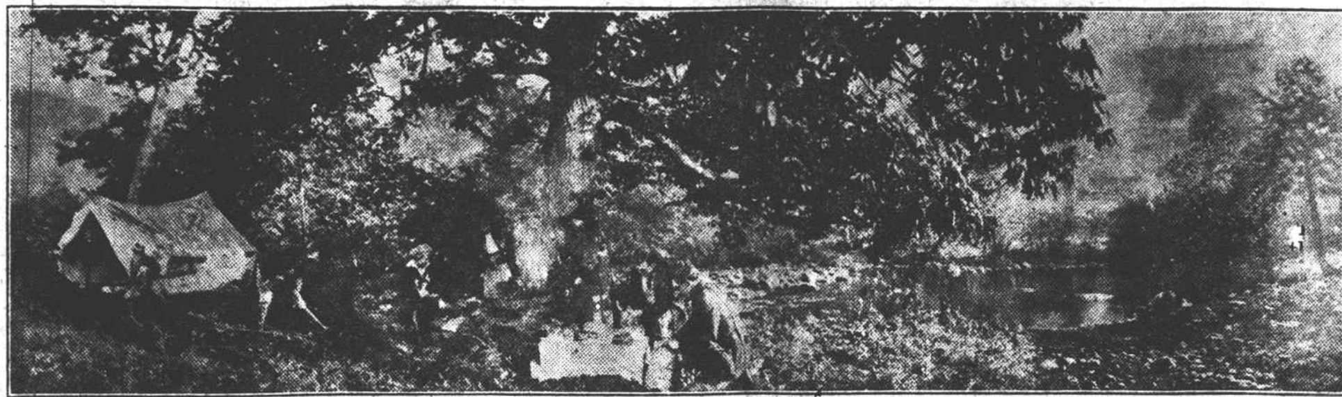
IN THE LAND OF THE SKY---TRYON THE GATEWAY

Other food distributing is more important to the convenience, and well of the entire population of the city as perhaps, a well equipped, sanitary bakery. A few years ago, a bakery thought of only as a confectionery. When "company" came up in the phaeton unexpectedly when "pa" brought a business acquaintance home to her before the bread was baked or sometimes on Sunday when the supply ran low, her wailing send one of the children to the bakery for a "nickel loaf of bakers' bread." All the older folks remember it, and what a light, airy, queer tasting loaf it was, too dry and devoid of any richness. Changes, too numerous to mention, as the thing goes, come to all lines of business, and the Bakery is no exception. A few years have brought marvelous changes. Now, no other labor saving institution unless it be the steam laundry, has done so much to rob housekeeping of its drudgery as the modern bakery shop. Tryon is fortunate in having a modern, up to date bakery; yet, being a progressive, modern town, Tryon would tolerate no other. Her bakery is known in this entire section as the Quality Bakery, and the window display such products are seen in the windows of the choicest city bakeries. The Quality Bakery is located