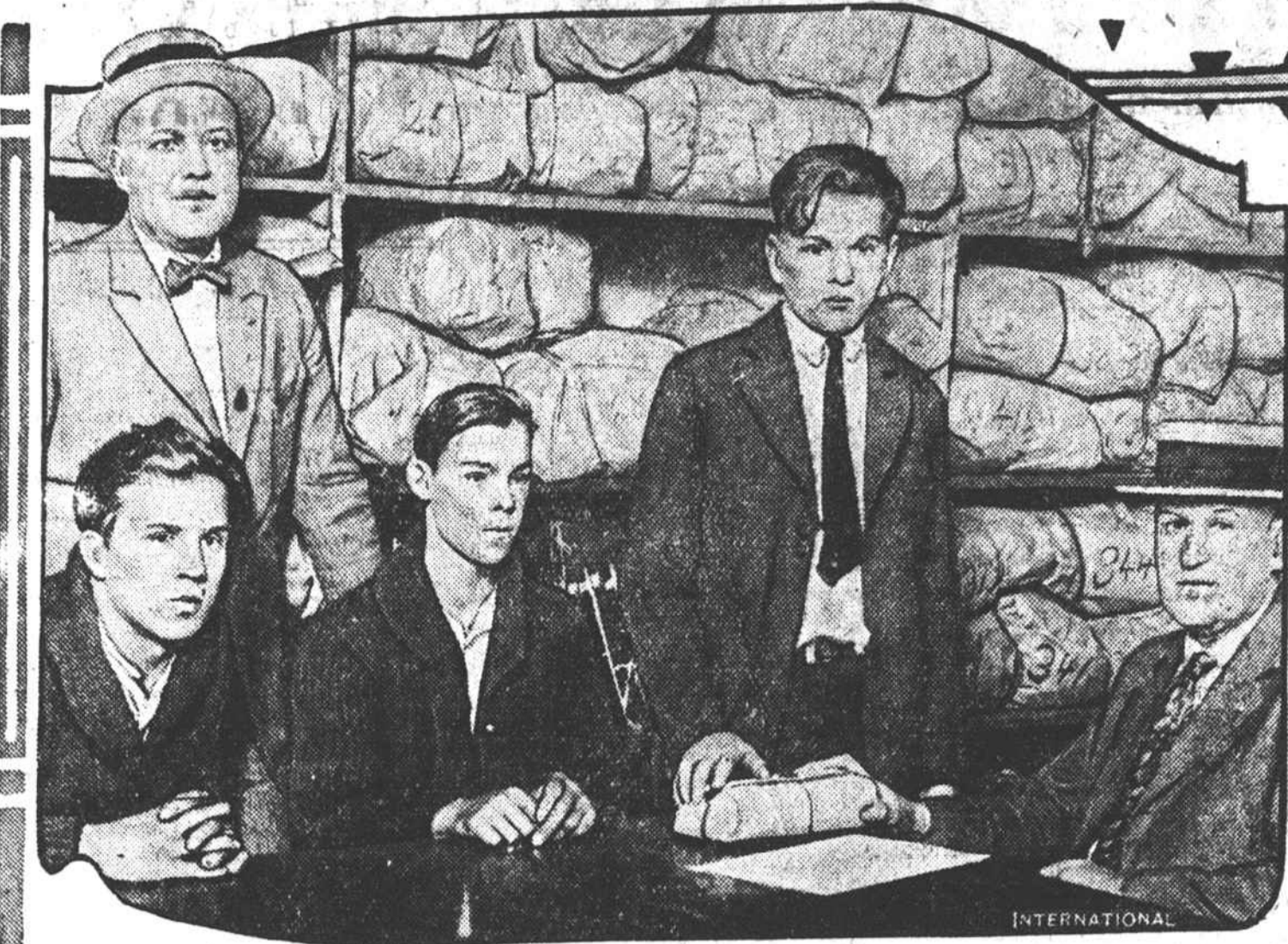
Three boys taken by the Chicago police who have confessed having written a letter received by Jacob Franks, father of Robert Franks, kidnaped and slain by sons of Chicago millionaires. The letter written by the youths threatened members of the Franks family unless $8,000 was left at an appointed place. They were trapped by police.