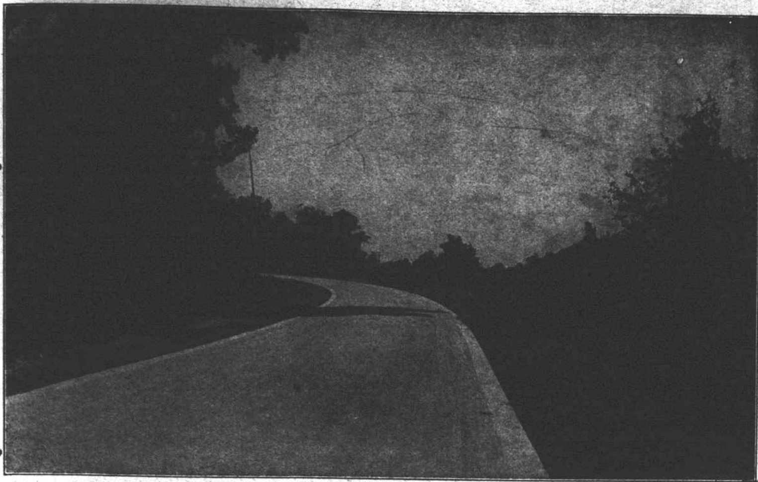
Hard Surfaced Highways are Making North Carolina the Motorists Paradise