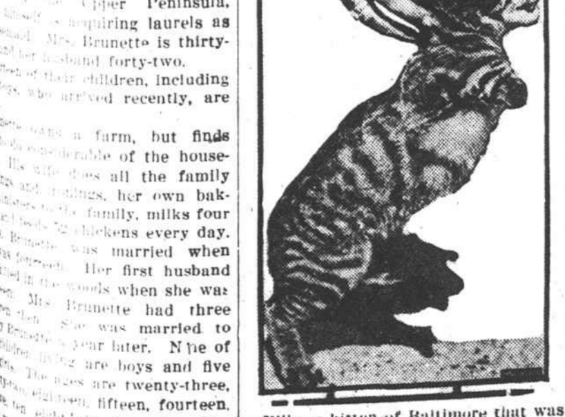
Billy, a kitten of Baltimore that was born with short front legs and extra