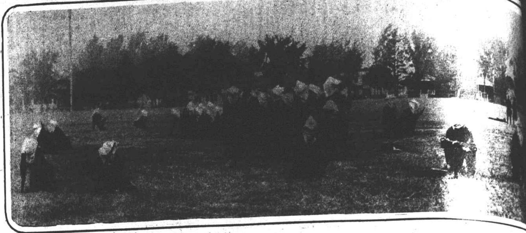
Pillowcase darkness at Plattsburg, N. Y., training quarters allows student officers to practice midnight