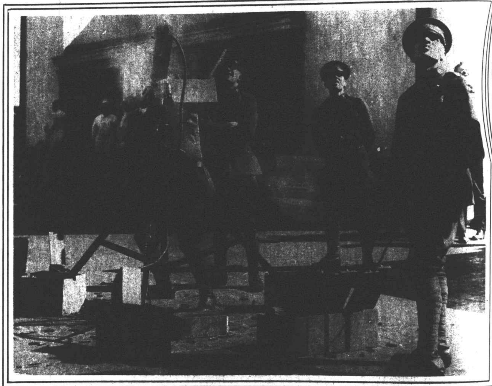
Atop the Copley Plaza, Boston, these World War Vets peppered away at a fleet of planes from a nearby Army base and successfully repelled them.