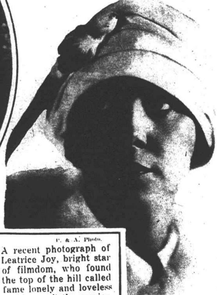
A recent photograph of Leatrice Joy, bright star of filmdom, who found the top of the hill called fame lonely and loveless and has quit the movies.