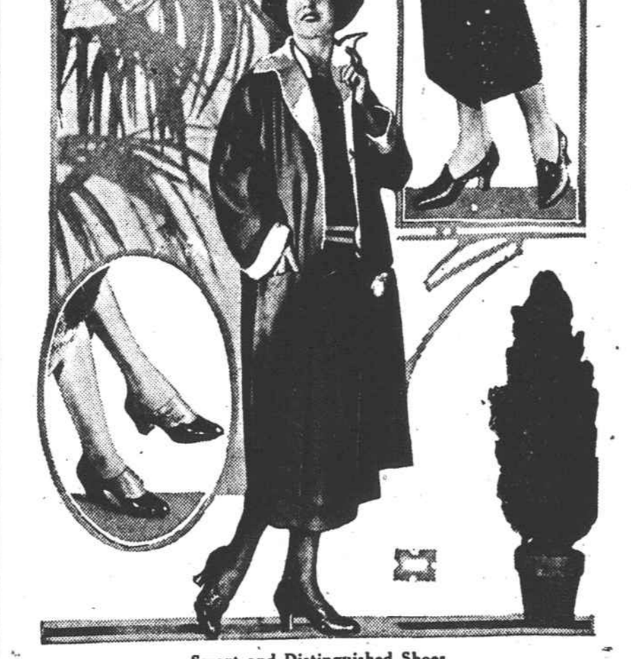
Smart and Distinguished Shoes.

Heat the milk in the double boiler. Moisten the cornstarch in a little cold milk, add, stir until thick, and cook until the starchy taste disappears.