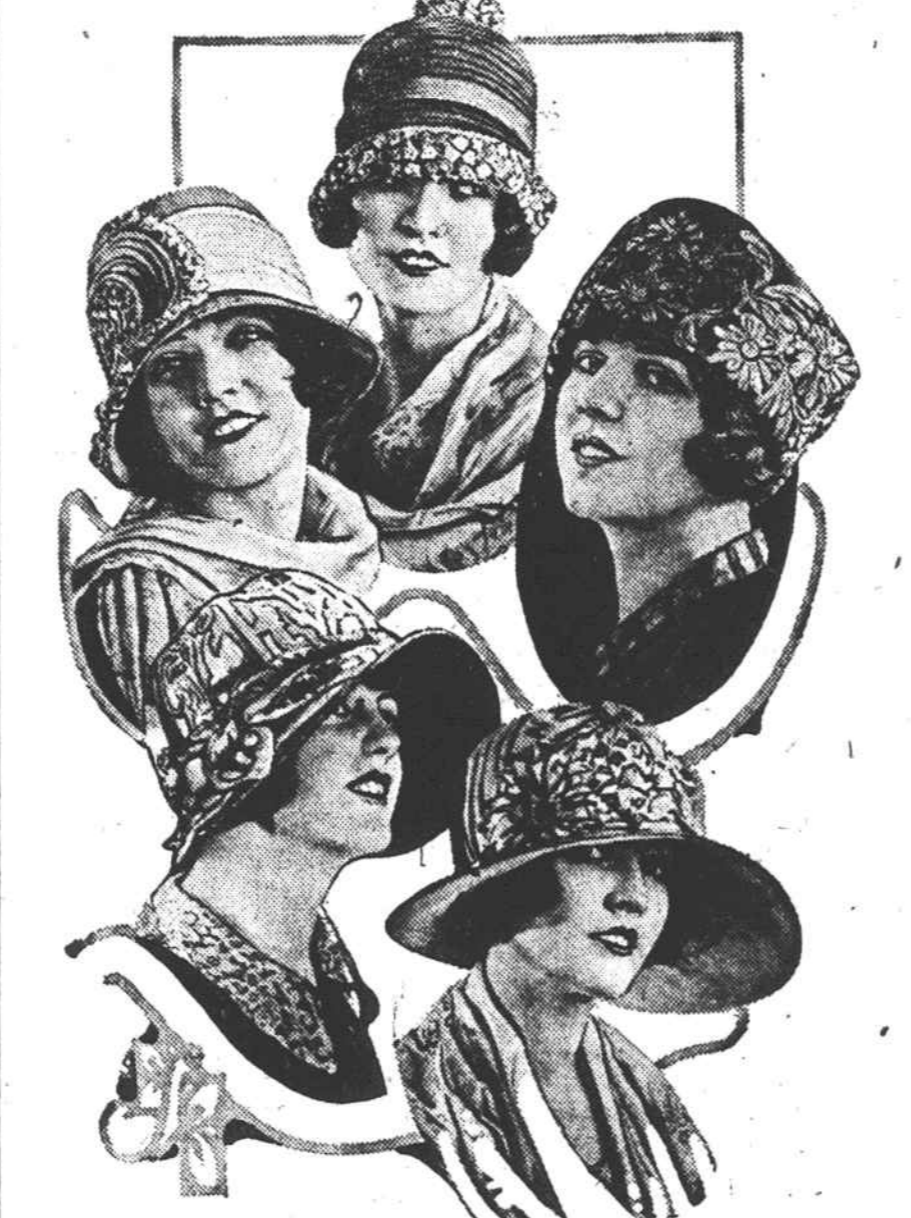
Some Contributions for Spring.

A great name is signed to the three hats at the top of the group. At the