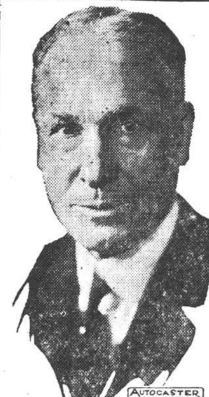
Dr. Jacob G. Schurman, former president of Cornell university and minister to China under Harding, is the new U. S. ambassador to Germany.