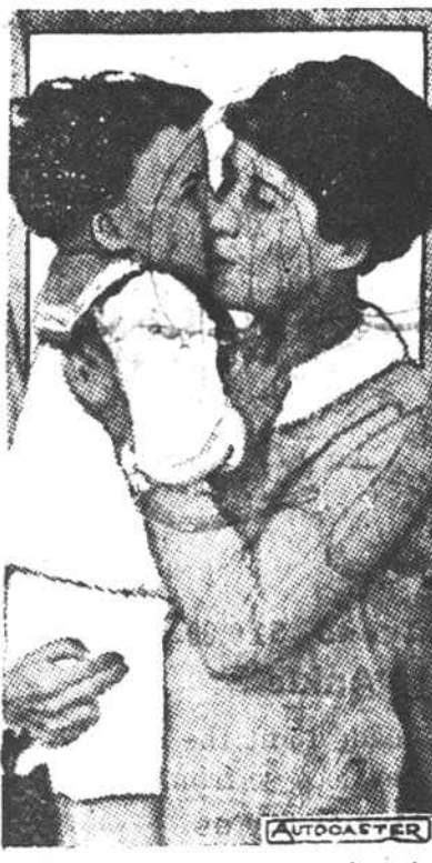
Mrs. Coolidge is never happier than when tiny tots call on her at the White House—this one getting a real love kiss during his May-Day call. Regular preaching service at the Columbus Presbyterian church next Sunday night at 8 o'clock. The public of both cities cordially invited.