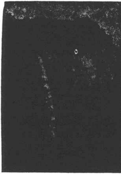
Hickory Nut Falls Takes a sheer plunge of 400 feet from Chimney Rock Mountain, and a total descent of 1,800 feet to join the Rocky Broad River.