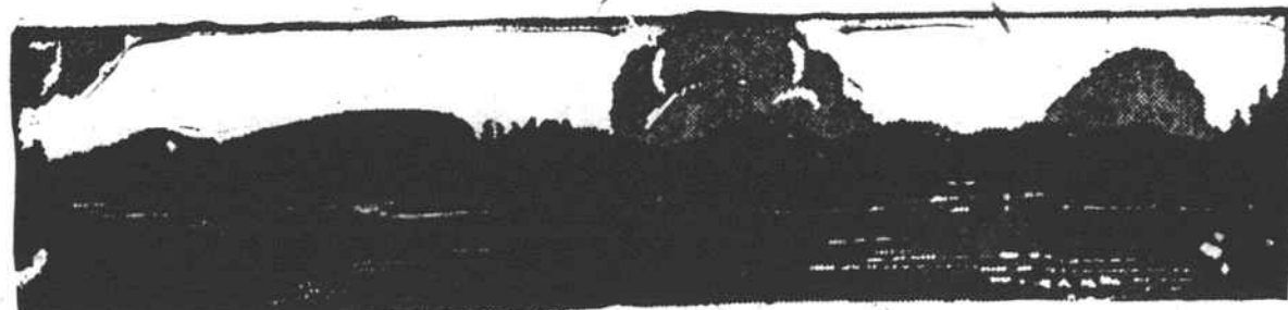
PANORAMA OF LAKE LURE AS IT WILL APPEAR WHEN COMPLETED