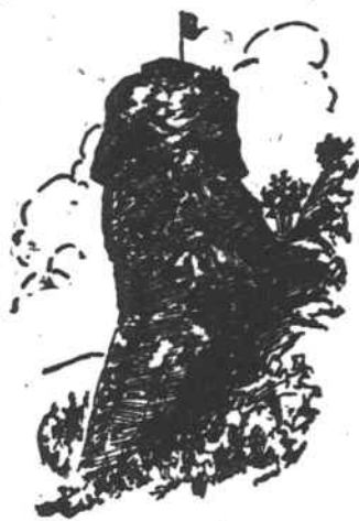
Famous Chimney Rock at head of Lake Lure. The company has an advantageous option on this scenic attraction. 43,000 persons paid $1.00 each to ascend it last year.