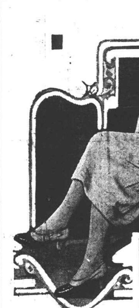
Combines Fiber Silk With Wool.

Right by their side we come across many variations of those trouser suits, which are borrowed from the Chinese, and of which a pretty example is pictured here. In this suit plain crepe de chine is chosen for the trousers and a "modernistic" printed pattern for the