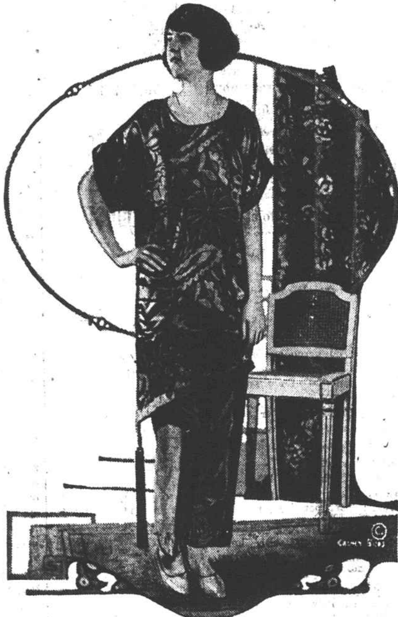
Whimsical Fancy in Negligees.

Seasons may come and seasons may go, but as far as knitted underwear fashion is concerned its stream of fascinating ideas flows on forever. Just now it is the exploiting of fiber silk, preferably called rayon, according to modern fashion language, which lends zest to the latest knitted modes. Very timely is this employment of rayon in knitted construction, for it