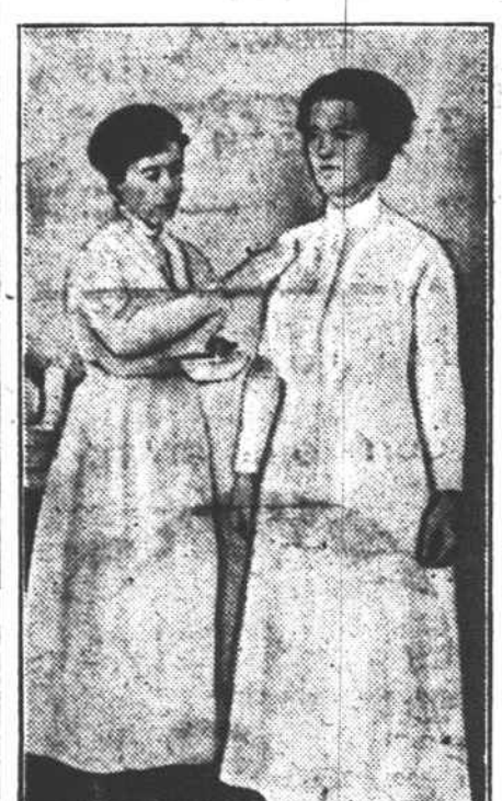
Making a Gummed Paper Form.

... In the clothing work in Thurston county, Washington, the home demonstration agent, representing the United States Department of Agriculture and the state agriculture college, spent ten days with three groups of interested women. After finding that the price quoted on commercial dress forms was $2.75, it was agreed to discontinue their use and substitute the gummed paper form, at a cost of $1 to each maker. Eight forms were finished at Grand Mound, 14 women were