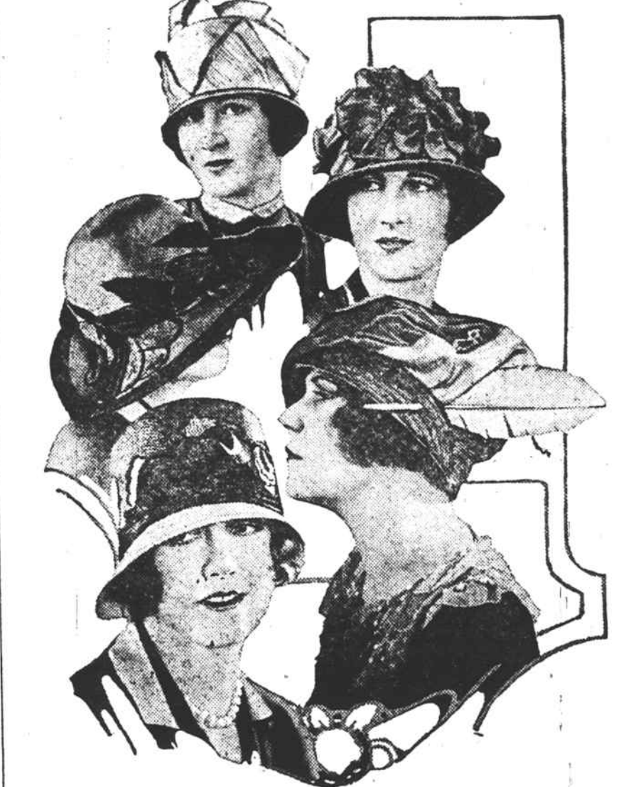
Some of the New Millinery.

Wide-brimmed milan hats, ballbuntings, bangkoks and hair braids are shown