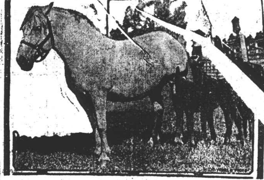
Twin Percheron colts, the only pair living, were born at the University of California agricultural college recently. They are here seen with their mother.