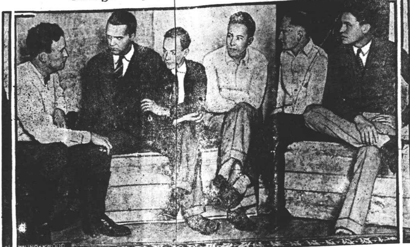
These five students of Lake Forest college, Illinois, shown with a police officer, were arrested for burglary. Two of them were caught stealing automobile tires and the others admit that they robbed a residence of household furnishings for their fraternity house.