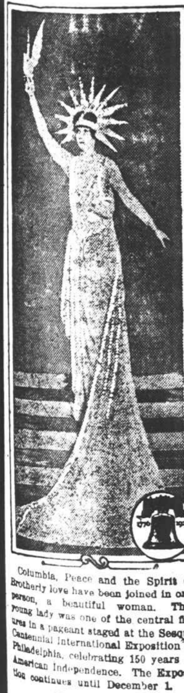
Columbia, Peace and the Spirit of Brotherhood have been joined in one person, a beautiful woman. This young lady was one of the central figures in a pageant staged at the Sesqui-Centennial International Exposition in Philadelphia, celebrating 150 years of American Independence. The Exposition continues until December 1.