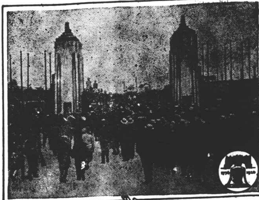
This picture is typical of many such scenes enacted daily at the main gates of the Sesqui-Centennial International Exposition in Philadelphia where the 150th anniversary of the signing of the Declaration of Independence is being celebrated. The "shot" was made from outside the gates and shows the long sweep of historic Broad street, the main artery of the exposition. To the left can be seen one of the capitols of the Palace of Liberal Arts and Manufactures which covers nearly eight acres of grounds and which houses some of the finest exhibits ever seen. The Exposition will continue until December 1.

IF ITS GOOD HARDWARE WE HAVE IT! and the PRICE is right