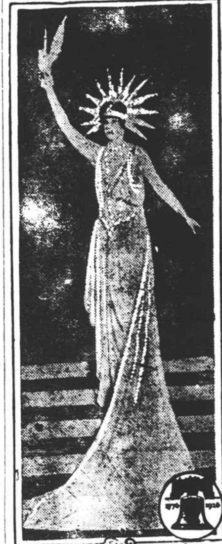
Columbia, Peace and the Spirit of Brotherly love have been joined in one person, a beautiful woman. This young lady was one of the central figures in a pageant staged at the Sesqui-Centennial International Exposition in Philadelphia, celebrating 150 years of American Independence. The Exposition continues until December 1.