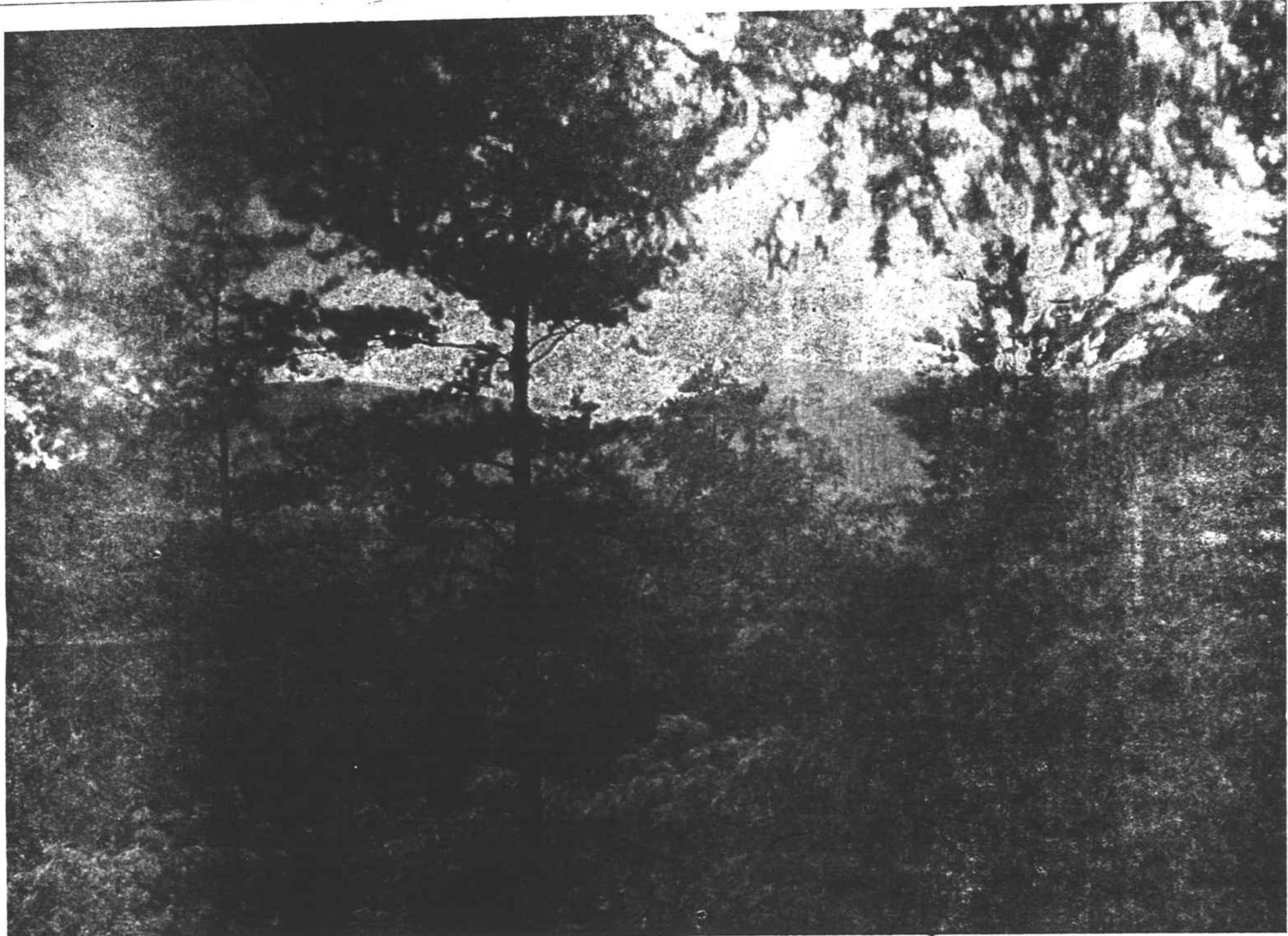
MOUNTAIN SCENE NEAR TRYON, N. C.

These hatcheries are not only of economic value in the propagation of fish, but they also should prove of extreme interest to visitors in western North Carolina. Plans are being made for providing camping facilities and guides for the enthusiastic angler, and no more perfect setting could be suggested for an enjoyable and profitable outing—satisfying the most particular of the followers of Izaak Walton, than