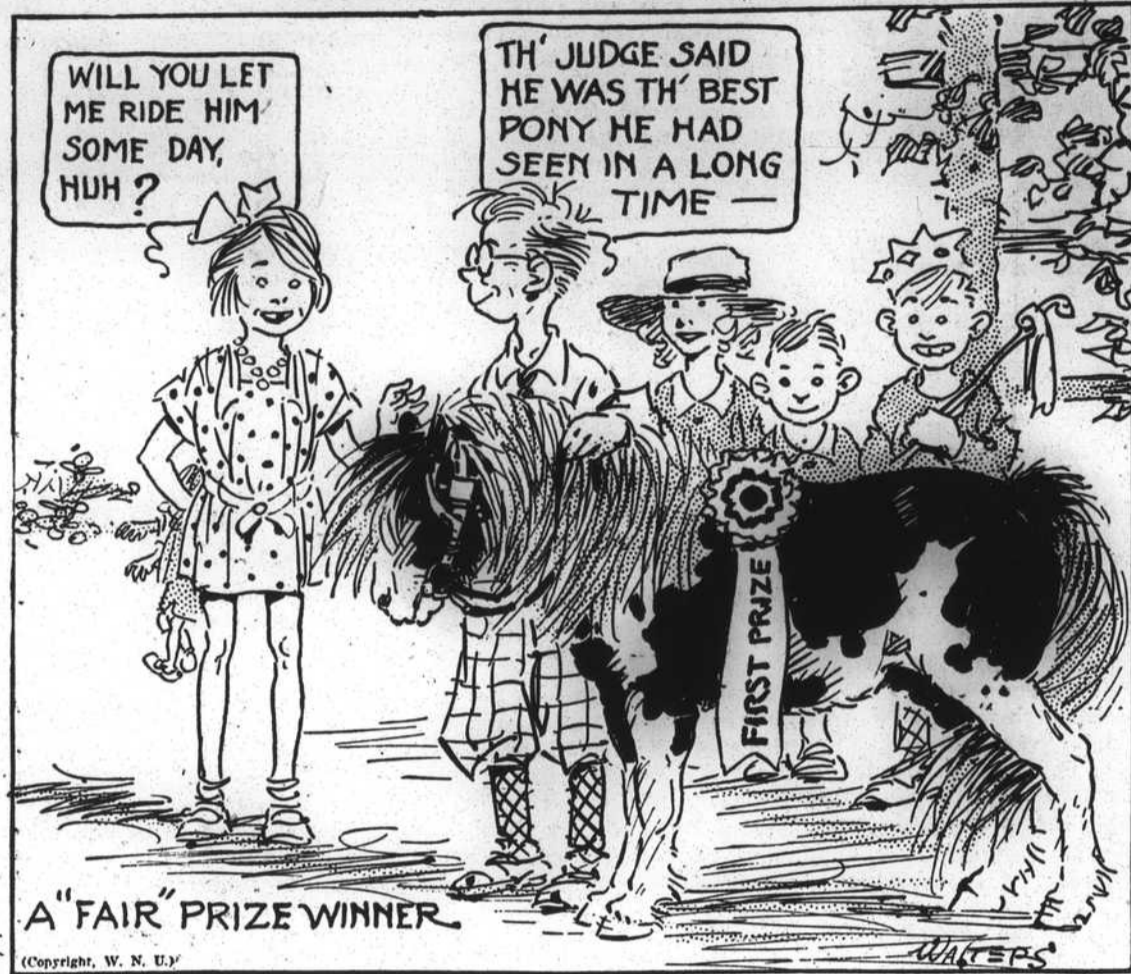
A "FAIR" PRIZE WINNER.