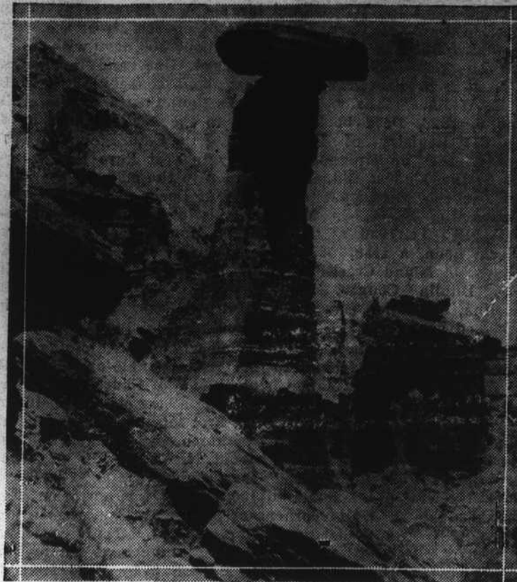
"The Devil's Tombstone," shown above, is in Palo Duro Canyon, near Canyon City, Texas, 18 miles south of Amarillo. The canyon is one of the beauty spots of Texas that will lure tourists in their 1936 visits to the Texas Centennial Exposition at Dallas and other celebrations throughout the state. The rock drew its name from an Indian belief that it was the burial marker of an evil spirit.