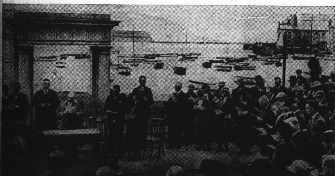
Representatives of American and British societies celebrated the anniversary of the sailing of the Mayflower in 1620 at the actual spot on the Barbican at Plymouth, Devonshire, England.