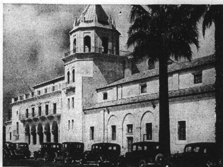
Here, beautifully situated amid palms, is the new municipal auditorium in San Jose, Calif. It was erected with the aid of a PWA grant of $500,000, and is the first unit of the city's proposed civic center. Other imposing buildings are expected to form a part of this new development, which will make San Jose one of the most imposing cities of California.