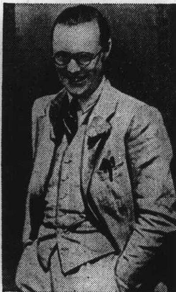
Prince Bernard Zur Lippe-Biesterfeld of Germany, whose engagement to Princess Juliana of Holland was announced recently.