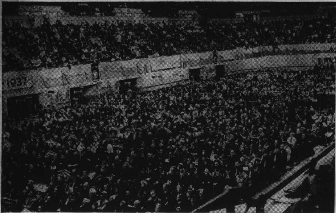
General view of the Cleveland auditorium with the American Legion annual convention in session. More than ten thousand veterans were present.