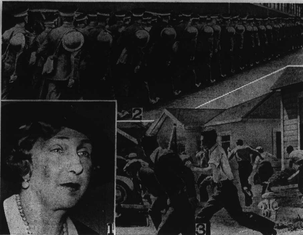
1—Ex-Queen Victoria of Spain in New York looking after her son, Count Covadonga, who is afflicted with haemophilia. 2—Members of the Coldstream Guards, who volunteered for service in Palestine, on their way to take ship to that country. 3—Pickets in the lettuce workers' strike at Salinas, Calif., routed by tear gas used by the state highway police.