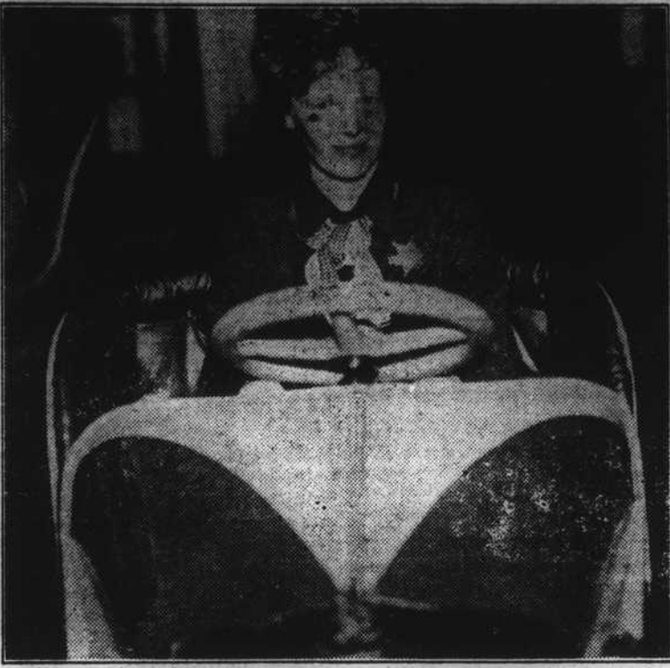
Amelia Earhart, famed aviatrix, tries her hand on a new kind of piloting—with a "Scooter Ride" auto on the Midway of the Texas Centennial Exposition in Dallas. The badge she wears is that of a constable from "Judge Roy Bean's Court."