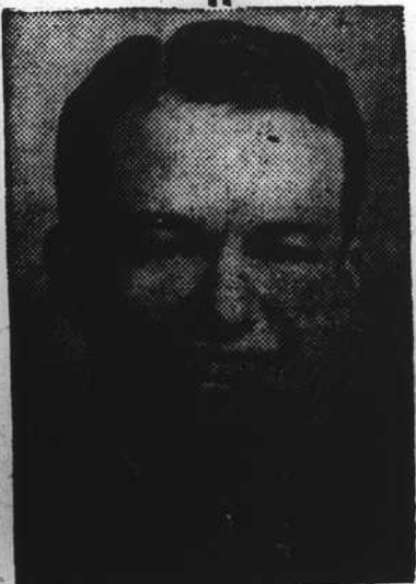
HAL THURSTON "King of Swing"