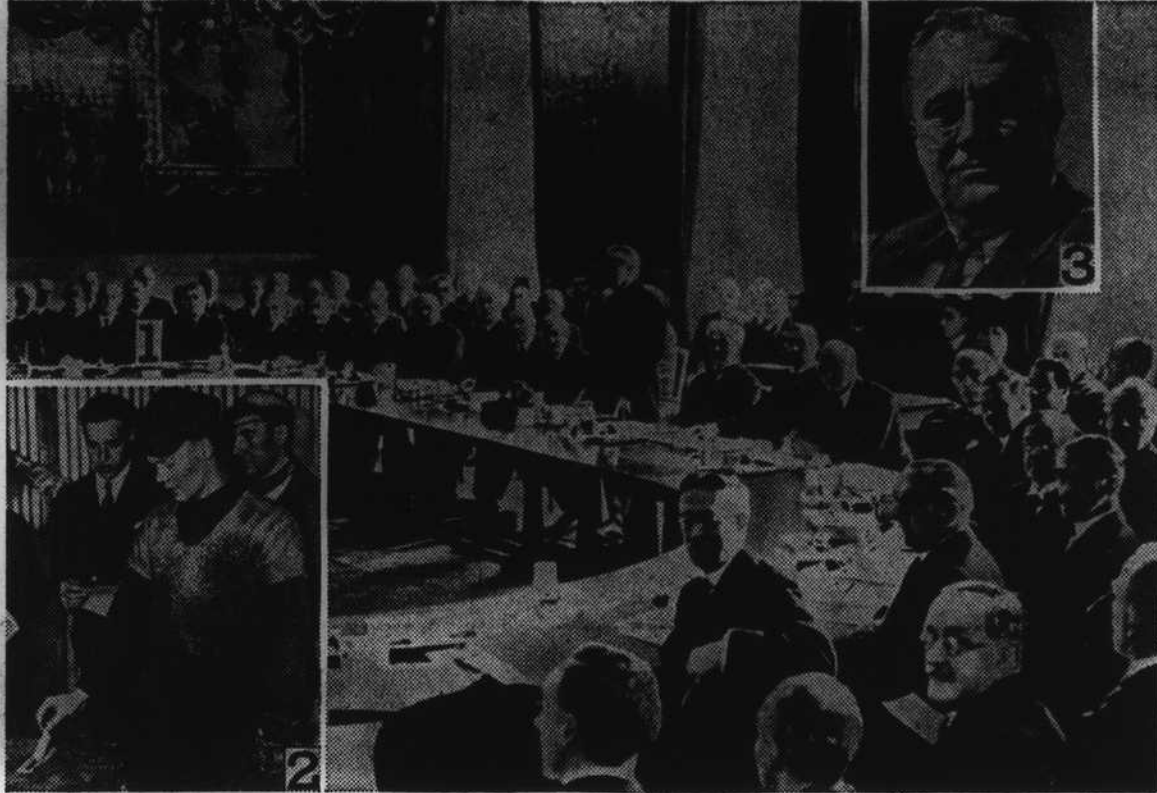
1—Scene in the Queen Anne room of St. James palace, London, as premiers of the various dominions and other delegates attending the Imperial conference following the coronation conferred on problems of the British empire. 2—Employees of the Jones & Laughlin Steel corporation, whose vote adopted a C. I. O. union for representation in collective bargaining. 3—President Roosevelt, who has asked congress to enact legislation establishing wage and hour standards for labor.