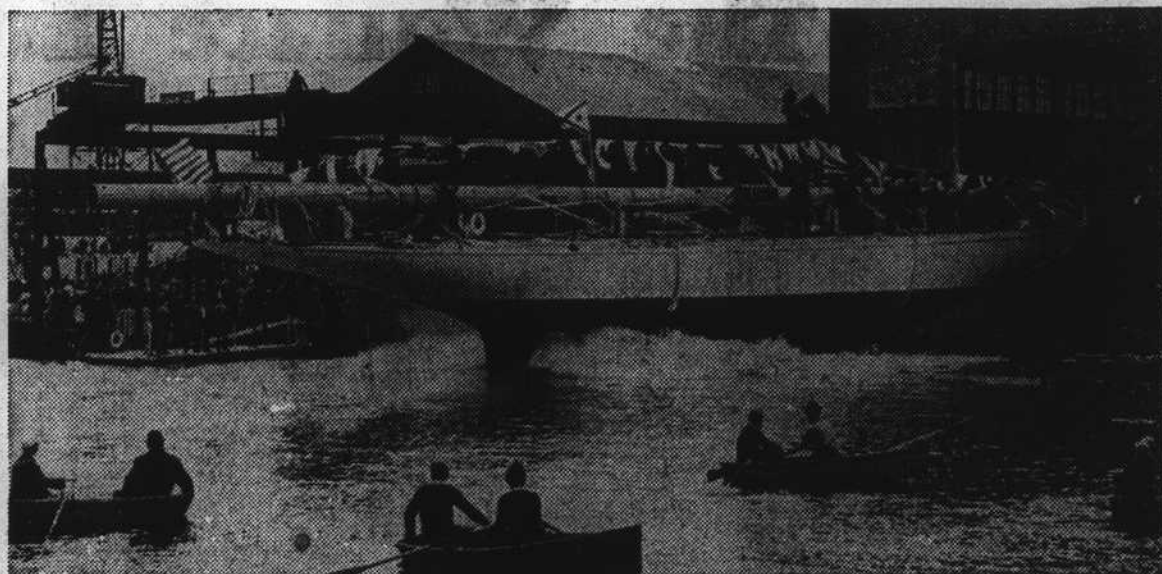
Soon after being launched at Bath, Me., the Ranger, Commodore Harold S. Vanderbilt's America's cup contender met with disaster on her first test run and lost her mast. Towed to port it had to undergo repairs to fit for competition with other American ships for the honor of meeting the British challenger, Endeavor II. Scene above shows the Ranger at the time of her launching.