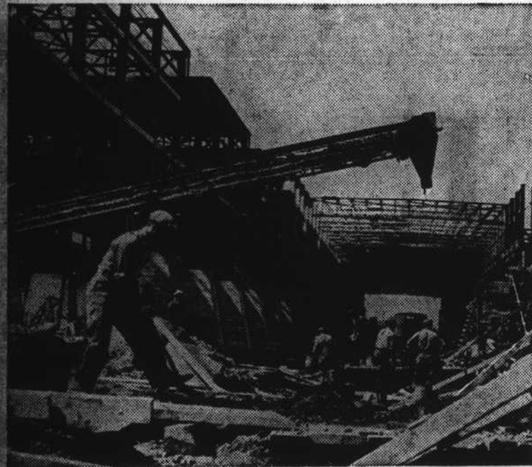
A new "Little Ruhr" is rising seven miles up the Cuyahoga river from Cleveland, Ohio, which will mark it as America's meeting grounds for iron ore and coal. The development is part of the Republic Steel corporation's program of expansion. A $15,000,000 plant, shown above, is under construction, which, when completed, will be the world's most continuous strip mill.