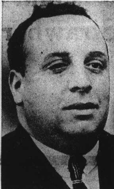
Indalecio Prieto, dynamo of the loyalist cause who has become key man of the civil war in the new Spanish republican cabinet organized by Premier Juan Negrin. He plans to revamp the fighting forces.