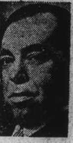
Irwin S. Cobb

Whence arises the present-day delusion that going about dressed at half-mast enhances the attractiveness of the average adult? Our forbears of the Victorian era wore too much for health or happiness or cleanliness. But isn't it worse to offend the eye all through the lingering summer by not wearing enough to cover up blemishes, the bulges and the bloats that come with maturity? Sun baths should be taken on a doctor's prescription, not at the corner of First and Main.