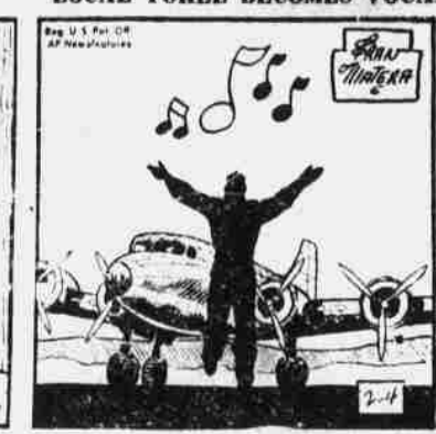
" SAILING, SAILING!