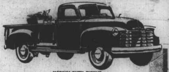
MEDIUM-DUTY PICKUP Model 3604—125 1/4-inch wheelbase, Maximum G.V.W. 5800 lb. Other models available: 3804—137-inch wheelbase, Maximum G.V.W. 6700 lb.; 3104—116-inch wheelbase, Maximum G.V.W. 4600 lb.