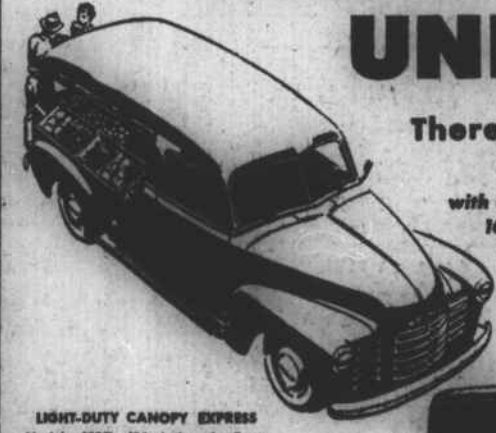
LIGHT-DUTY CANOPY EXPRESS Model 3107—116-inch wheelbase, Maximum G.V.W. 4600 lb. Also available in Medium-Duty Model 3807—137-inch wheelbase, Maximum G.V.W. 6700 lb.