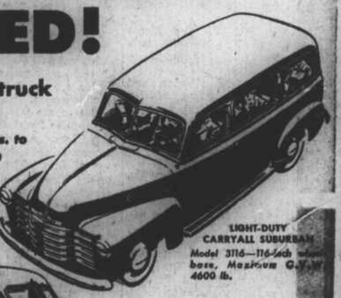
LIGHT-DUTY CARRYALL SUBURBAN Model 3116—116-inch wheelbase, Maximum G.V.W. 4600 lb.