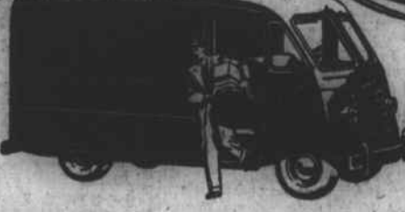
FORWARD-CONTROL CHASSIS Model 3742—125 1/4-inch wheelbase, Maximum G.V.W. 7000 lb. Also available in Model 3742—137-inch wheelbase, Maximum G.V.W. 16,000 lb. Package Delivery type Bodies suitable for mounting on the Forward-Control Chassis are supplied by many reputable manufacturers.