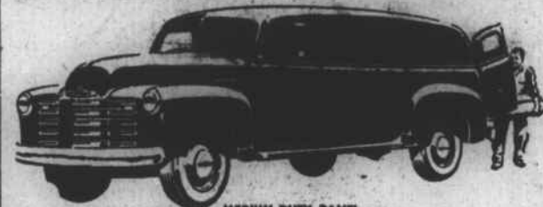
MEDIUM-DUTY PANEL Model 3805—137-inch wheelbase, Maximum G.V.W. 6700 lb. Also available in light-duty Model 3105—116-inch wheelbase, Maximum G.V.W. 4600 lb.

ANNOUNCING THE OPENING OF OFFICES FOR THE PRACTICE OF LAW GENE C. SMITH FRONT STREET BEAUFORT