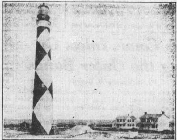
Carteret county's own light house, Cape Lookout. On clear days this diamond-patterned light can be seen from a distance of 25 to 30 miles.