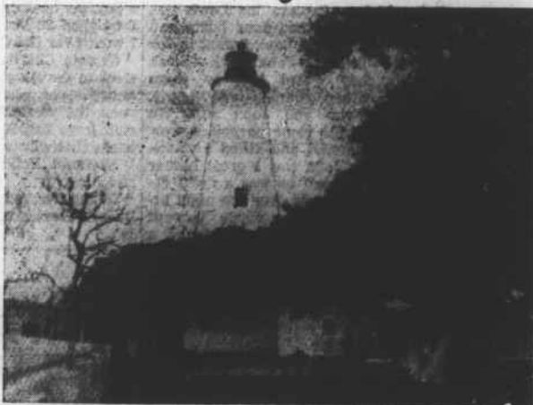
Ocracoke light house, in its setting of wind-molded live oaks and cedars, is one of the most attractive along the Atlantic coast.

following 1936 grassed dunes went on the offensive and pushed the ocean back, making restoration of this 190-foot brick tower possible. The reflections above are in a fresh water pond behind the light.