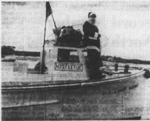
Even Santa Claus comes by boat to Beaufort.