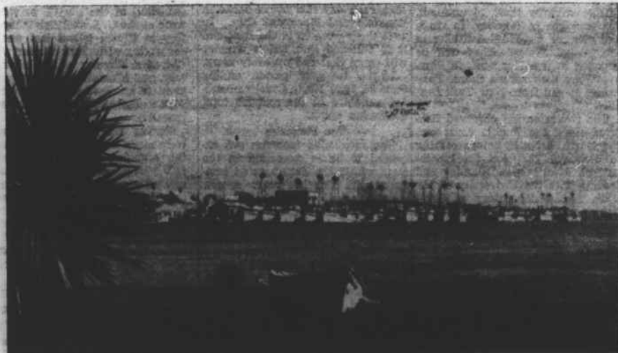
The menhaden fleet along Beaufort waterfront.