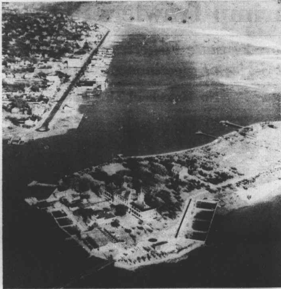
An air view of Piver's Island also shows Beaufort in the background. In the center of the picture is the United States Fisheries Biological laboratory, to the right are the terrapin pens (the