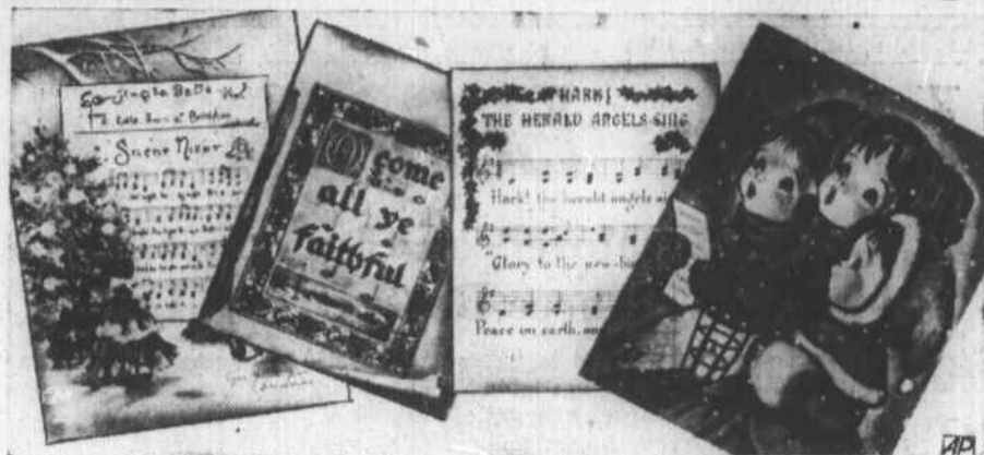
Song of songs . . . Carols take over, even on Christmas cards.