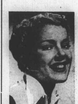
Make Your Appointment For That Christmas Permanent Just Call 2-8206

More than a quarter million persons are employed in the textile industry in North Carolina, which leads the nation.