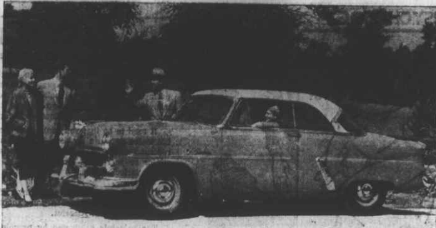
The new 1952 Ford "Victoria" is a member of the Ford Crestline which also includes the Sunliner convertible and the Country Squire station wagon. The Victoria combines unobstructed side visibility and open-car advantages of a sports vehicle with the all-weather protection of steel sedan top construction. It is available in a wide variety of interior trim, upholstery and solid or two-tone body colors.