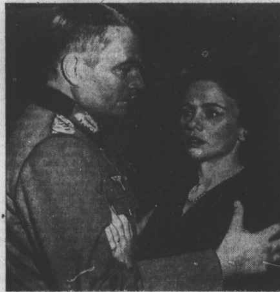
James Mason, as Field Marshal Erwin Rommel, holds Jessica Tandy, who plays his wife, as she gets a bit of bad news in a scene from Twentieth Century-Fox's "The Desert Fox," the dramatic story of Rommel.