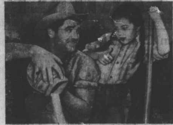
Steve Cochran and Sherry Jackson as they appear in 'The Lion and The Horse,' action drama filmed outdoors in color and produced by Bryan Foy.