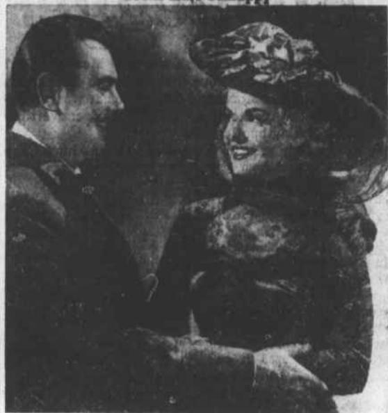
Lucky partners. George Brent isn't at all unhappy about lovely Jane Russell winning a half interest in his frontier saloon, a scene from RKO Radio's adventure romance in Technicolor, "Montana Belle," in which they are co-starred, with Scott Brady, Forrest Tucker and Andy Devine importantly cast.