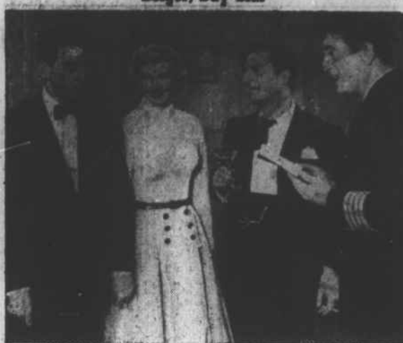
Ray Bolger, Doris Day, Claude Dauphin and George Givot in a scene from "April in Paris."