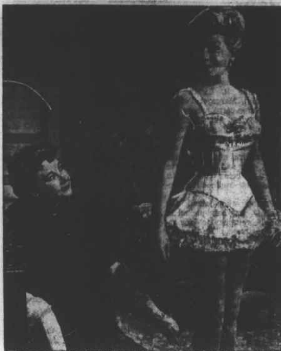
When an American girl dresses up for her presentation to royalty, even her beribboned, lace corset deserves the closest scrutiny. Here, Lana Turner poses for inspection by her companion, Una Merkel, in a scene from M-G-M's lavish Technicolor production of "The Merry Widow." Fernando Lamas co-stars with Miss Turner in the famous Franz Lehár musical romance.