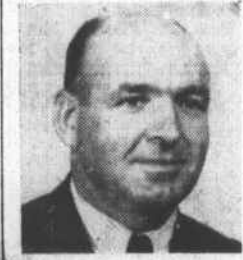
Special Representative OCCIDENTAL LIFE INS. CO. Home Office: Raleigh, N. C.