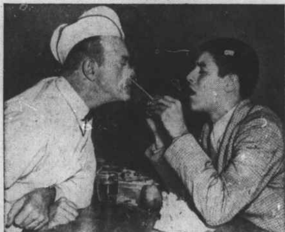
A scene from the hysterically funny movie, The Stouge, which stars Dean Martin and Jerry Lewis.