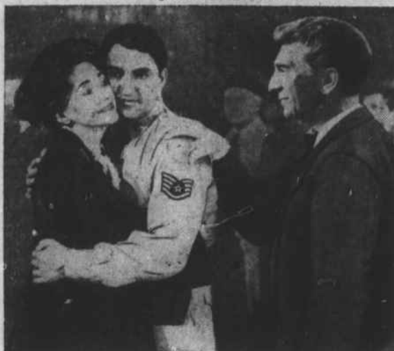
Danny Thomas and Peggy Lee are stars of the new version of the 1927 film, The Jazz Singer.