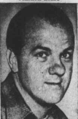
Academy award winner Karl Malden stars in Bernhard-Vidor Productions' "Ruby Gentry," the new drama which also lists Jennifer Jones and Charlton Heston.