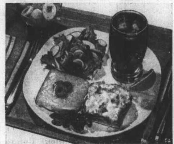
Open face crab and cheese sandwiches for summer lunch.

By Cecily Brownstone Associated Press Food Editor