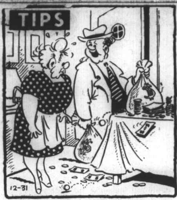
'Did I find a swell job in THE NEWS-TIMES classified