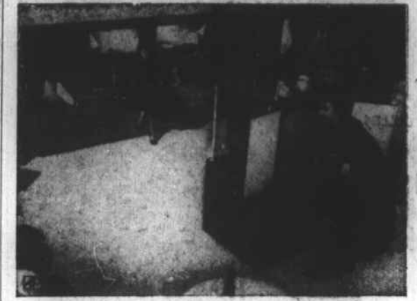
Television set in room divider swivels in any direction

Furniture Producers Develop Space Saving Units for One-Room Living