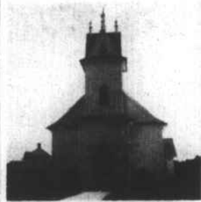
Present building ... F.W.B. Church at Davis