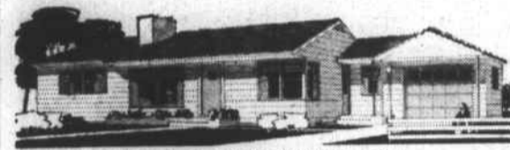
A SMALL HOUSE PLANNING BUREAU DESIGN NO. C-246