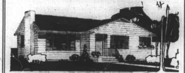
A SMALL HOUSE PLANNING BUREAU DESIGN NO. C-167-G.