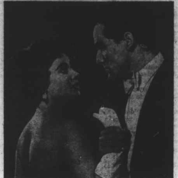
M-G-M presents the pulsating story of a woman who lives for love, filmed against the magic settings of Paris, St. Moritz and the Riviera. In color by Technicolor, "Rhapsody" stars Elizabeth Taylor, Vittorio Gassman, John Ericson and Louis Calhern.