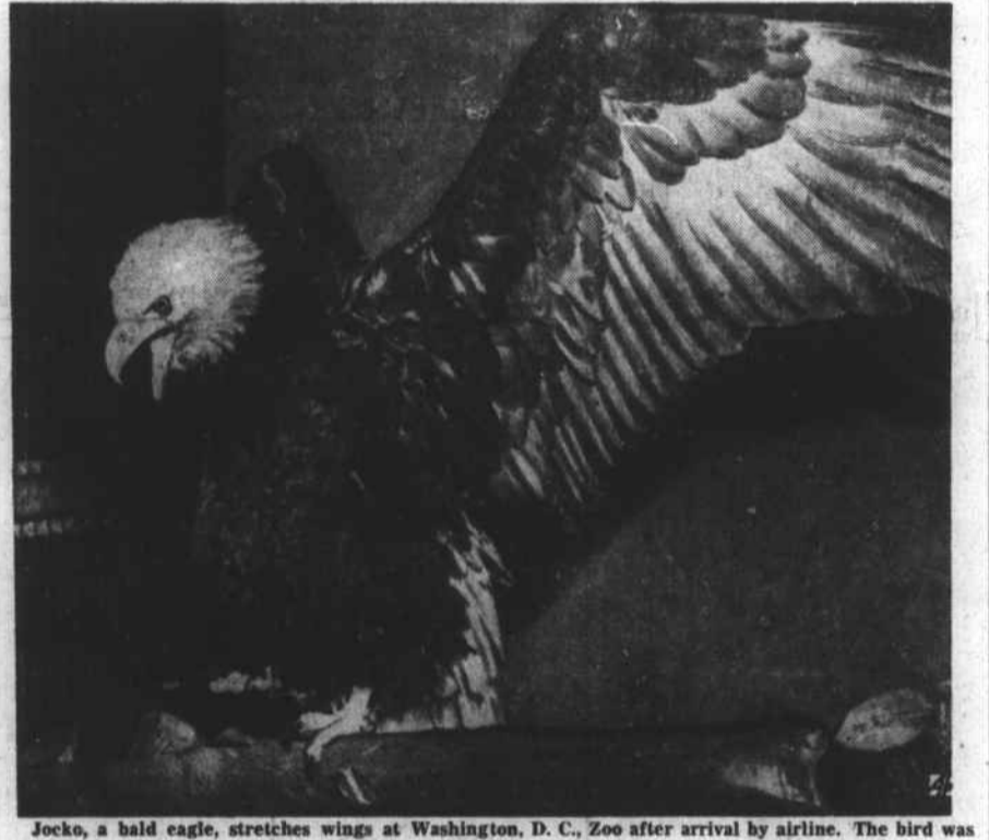
Joeko, a bald eagle, stretches wings at Washington, D. C., Zoo after arrival by airline. The bird was rescued from the ice in upper Michigan and nursed back to health.