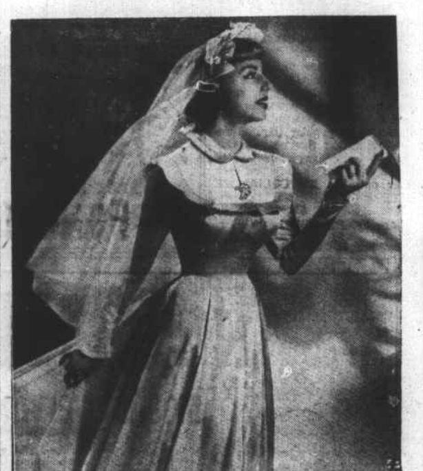
The demure simplicity of a Quaker dress is suggested by this dramatic wedding gown in palest blue satin, with prim high collar and yoke edged in ruching. One glittering accent is a diamond clip in a design matching the engagement ring.