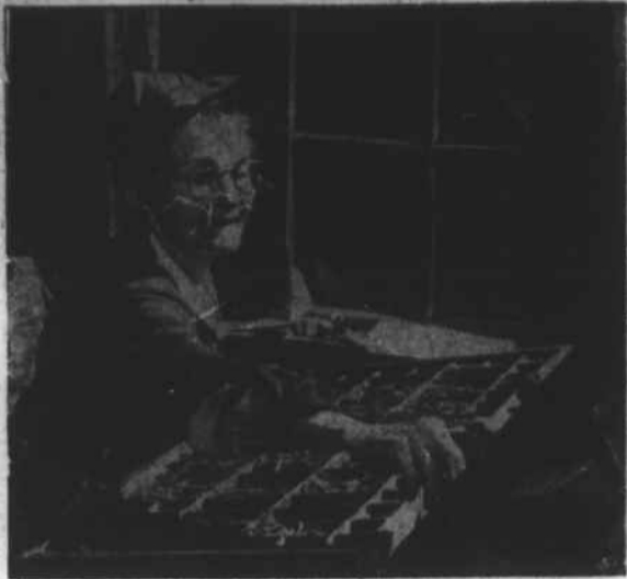
Miss Maud, still going strong at 80.