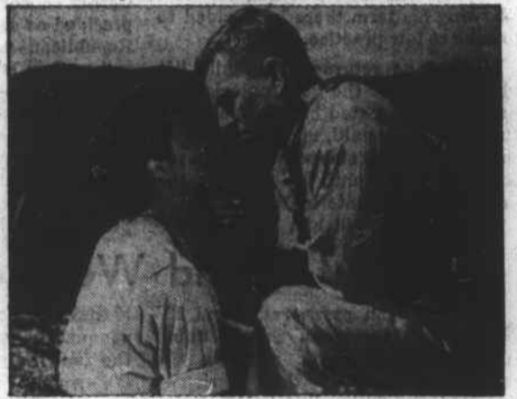
Lovely Joy Page and Sterling Hayden, working with the Italian underground in war time, fall in love in Allied Artists "Fighter Attack." J. Carol Naish is co-starred.