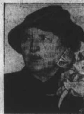
Marjorie Main concedes a point to dressiness and wears orchids on recent departure for Europe.

Off the stage, Miss Main pays little attention to her clothes. "If someone would write me a