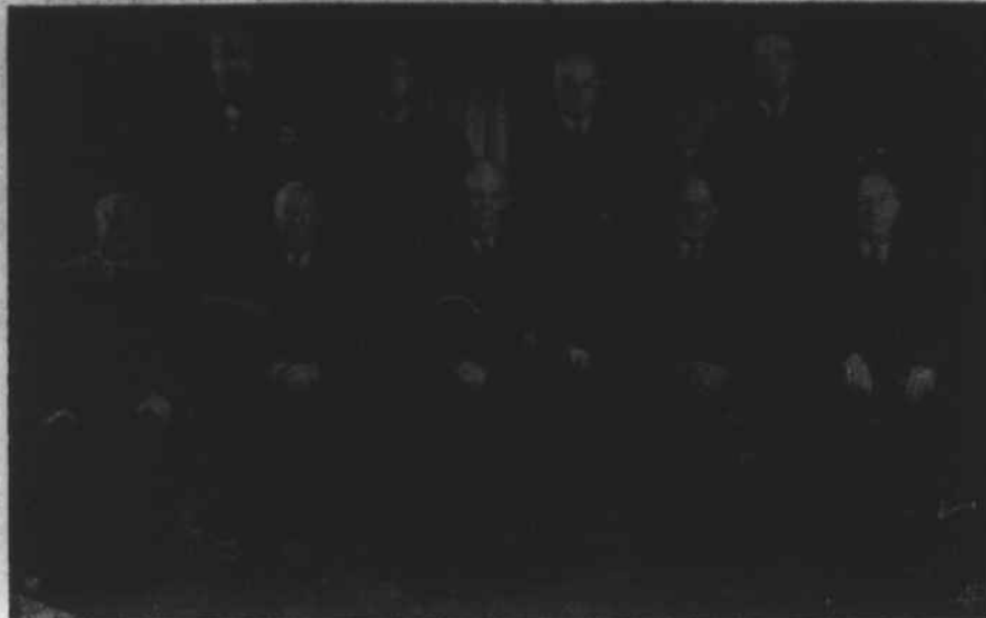
Members of the United States Supreme Court pose in Washington for their first official picture since the appointment of Earl Warren, former California governor, as Chief Justice. Left to right, seated: Associate Justices Felix Frankfurter and Hugo Black; Chief Justice Warren; and Associate Justices Stanley Reed and William O. Douglas. Standing: Associate Justices Tom Clark, Robert Jackson, Harold H. Burton and Sherman Minton. The court recently handed down a decision against segregation in the nation's public schools. Their ruling against segregation was unanimous.